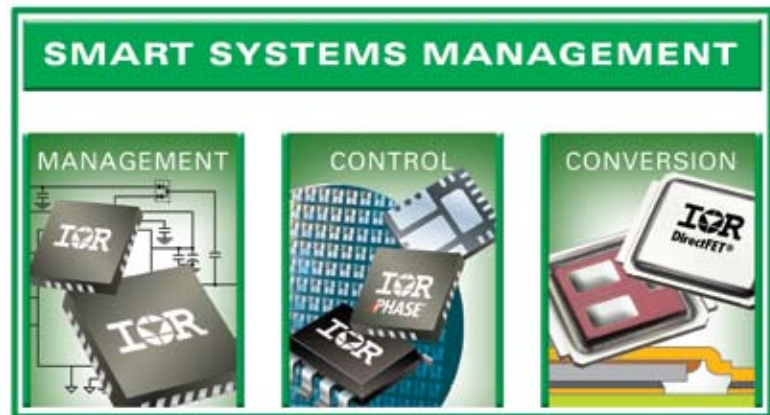
Figure 2: Integrated power management platform

By using efficient power devices coupled with innovative control schemes, it is possible to obtain an optimal combination of efficiency and electrical performance. Combined, these technology improvements can improve