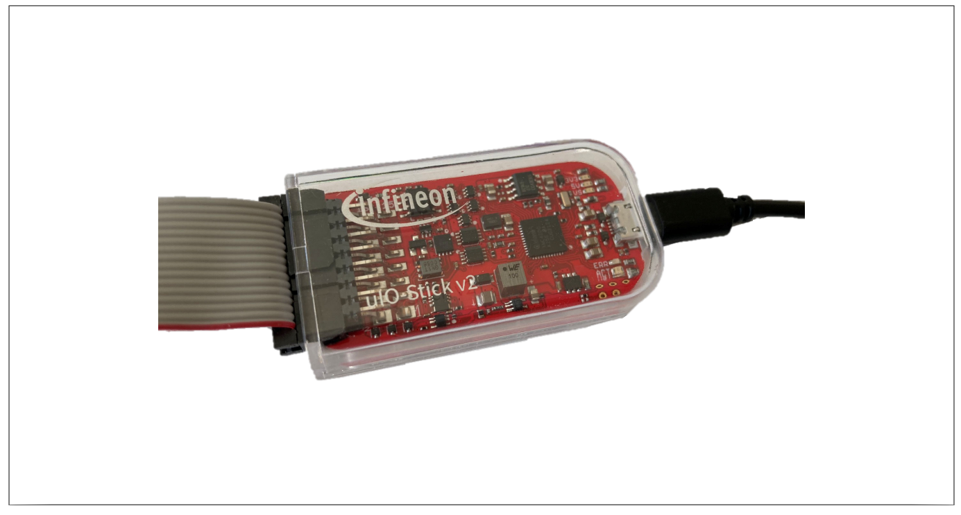
Figure 1 uIO-Stick v2

It offers a USB connection to the PC, and several different functionalities, for example SPI, CAN, and GPIOs. The uIO-Stick v2 registers as an HID on the PC, so no driver installation is needed.