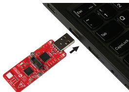
Fig-2: Powering the CySmart BLE 4.2 USB Dongle

Step 1: Plug the CySmart BLE 4.2 USB Dongle into a Windows PC.