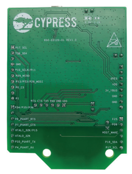
Figure 2: CYBT-423054-EVAL Bottom View

SW1: Reset Switch routed to the XRES connection on the module.