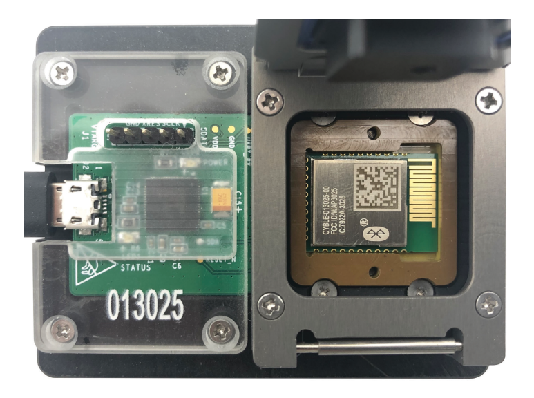
Figure 2: Module in the Socket

1. Insert the BLE module in the socket (ensure that the BLE module is in the correct position of the socket, as shown below).