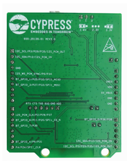
Figure 2: CYBT-333047-EVAL Bottom View

SW1: Reset Switch routed to the XRES connection on the module.