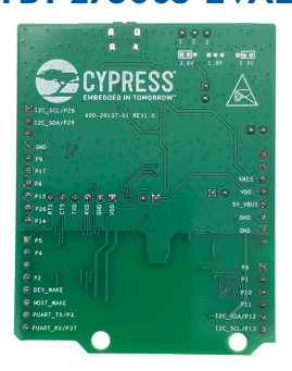
Figure 2: CYBT-273063-EVAL Bottom View

SW1: Reset switch routed to the XRES connection on the module.