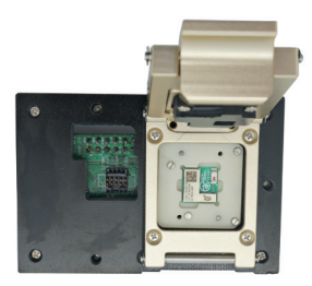
Figure 4: Module in the socket

2: Put the BLE module in the socket (ensure that the BLE module is in the correct position of the socket, as shown below)