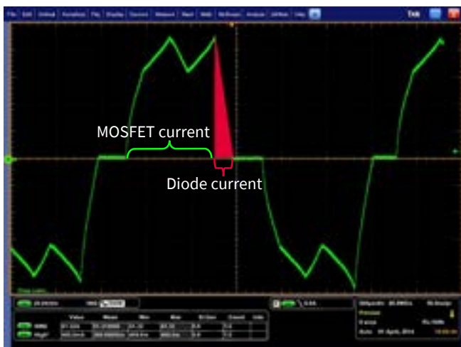
Figure 1: Typical phase current waveform; 61.3A RMS , 100% duty cycle; red triangle – diode conduction

An effective cooling concept, combined with a best-in-class BSC010N04LSI 40V/1mΩ SuperSO8 package with integrated Schottky-like diode, allows designers to switch from TO-220 to SMD packages, thereby reducing cost, increasing inverter power density, and improving tool performance.