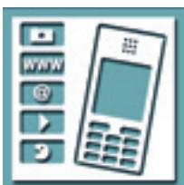
Mobile Phone Platforms