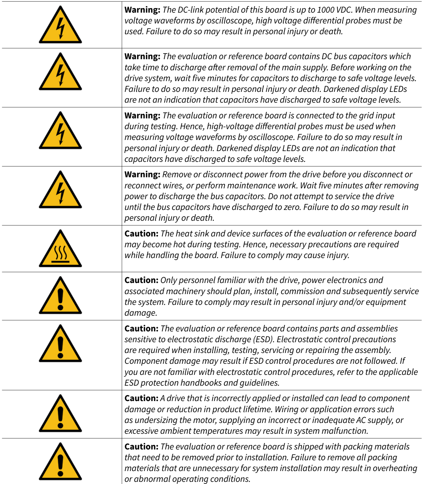
Table 1 Safety precautions

Note: Note the following warnings regarding the hazards associated with development systems.